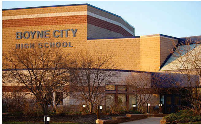
Boyne City High School

Charlevoix Public School District voters are being