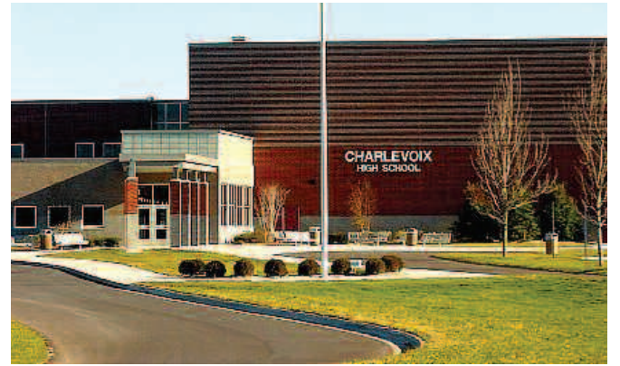
Charlevoix High School

Also on the ballot for the Charlevoix School District is a $4 million bond proposal. The bond would pay for remodeling, equipping, and furnishing school buildings; acquiring and installing instructional technology equipment; purchasing school buses; and equipping, developing and improving